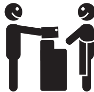
Pay at checkout